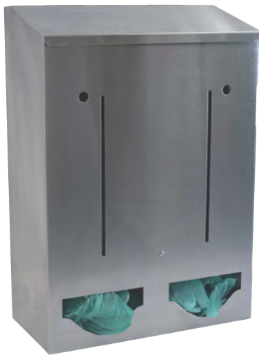
Double Bulk Dispenser #307022- 12"W X 5.75"D X 17"H