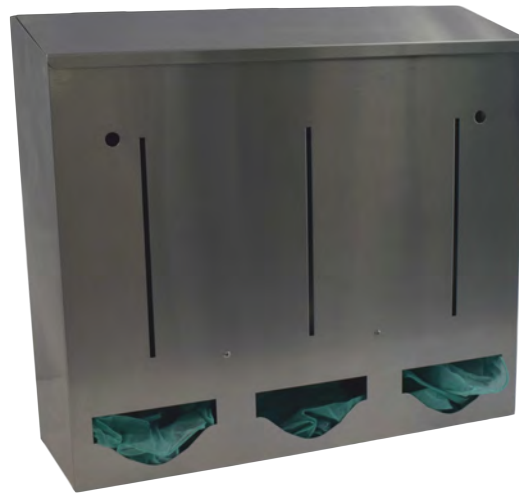
Triple Bulk Dispenser #307023- 18"W X 5.75"D X 17"H