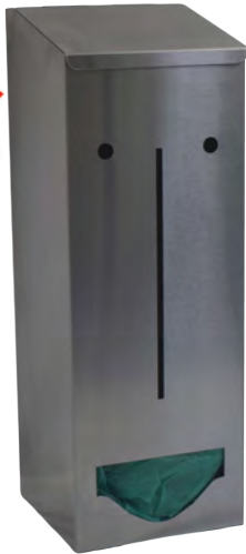
Single Bulk Dispenser #307021- 6"W X 5.75"D X 17"H